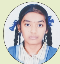
Honey (CEC) 94.2%