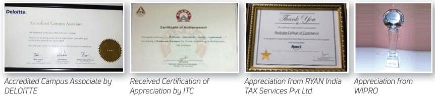
Accredited Campus Associate by DELOITTE

The Placements & Grooming Division has received appreciation and accolades for its commendable work and hospitality. Some of the few accolades received from companies.