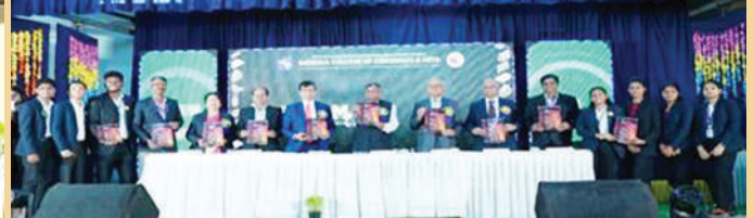
Litzine - The Literary Club's exclusive magazine Edition III – Volume - I titled "Ancient Architecture" was unveiled