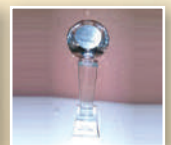
Appreciation from WIPRO