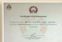
Received Certification of Appreciation by ITC