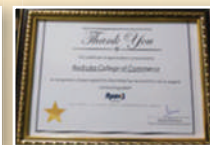
Appreciation from RYAN India TAX Services Pvt Ltd