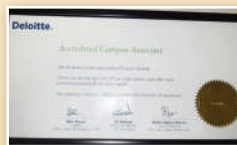
Accredited Campus Associate by DELOITTE

Some of the few accolades received from companies.